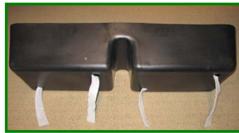
Fig. 4 Barrier Basket Liner