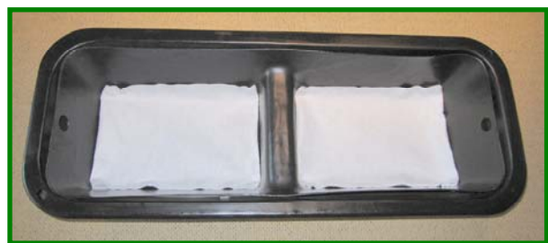
Fig. 5 Barrier Basket with Liner